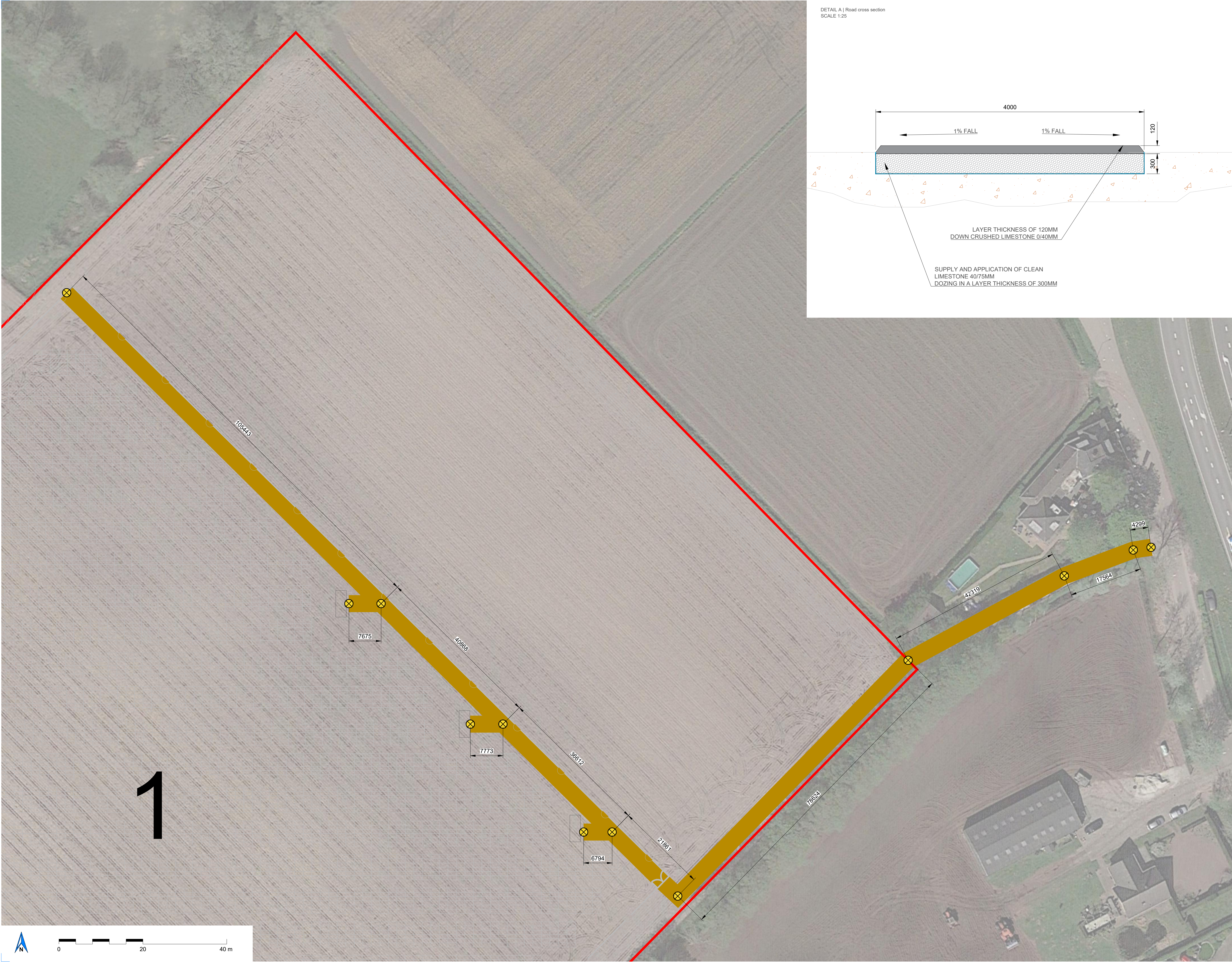
DETAIL A | Road cross section SCALE 1:25