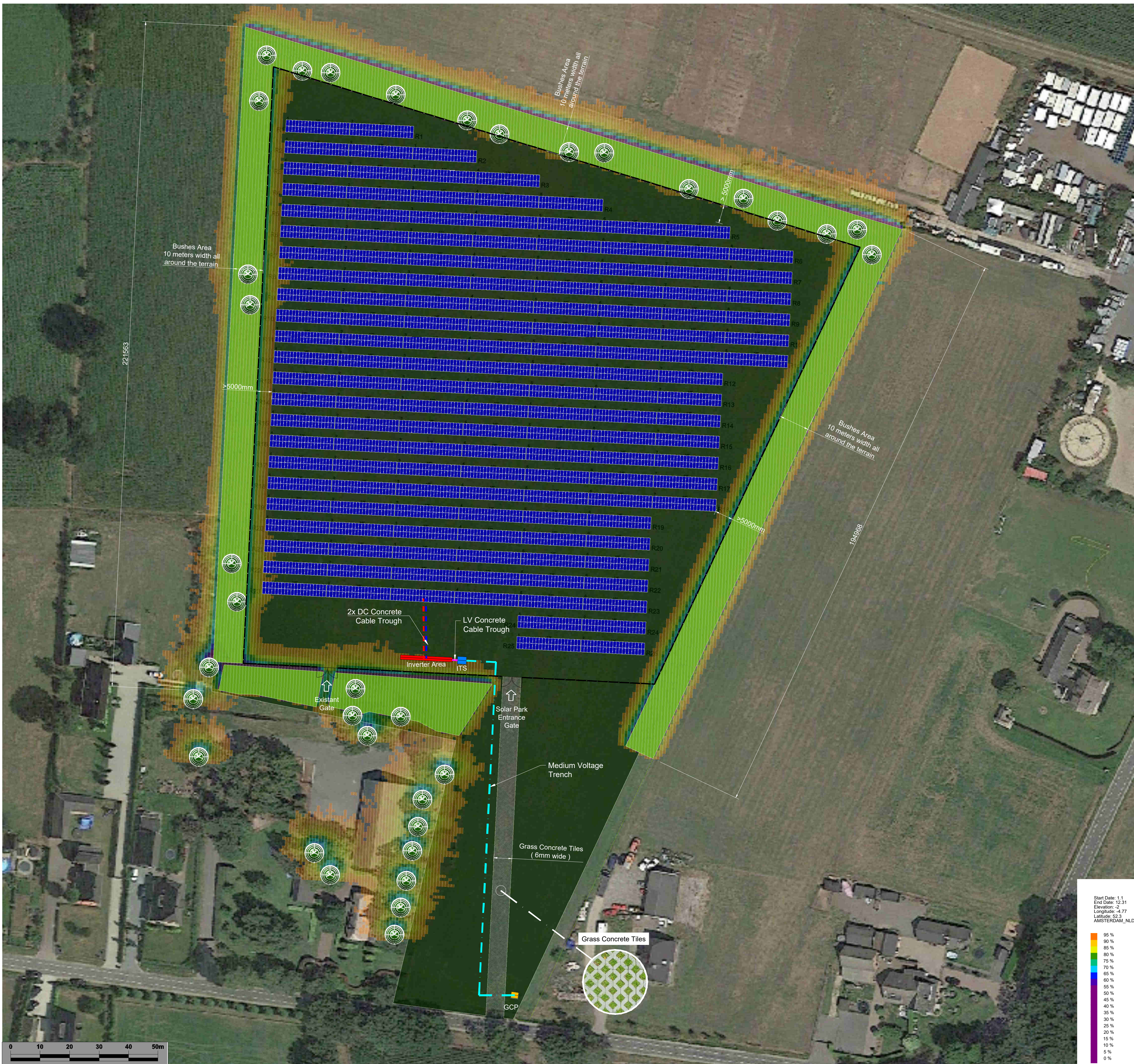
GA - General Arrangement of Ground Mounted system Scale 1:650

This drawing is the property of IKAROS Solar and is not to be reproduced nor used in any manner detrimental to our interests. All rights reserved.