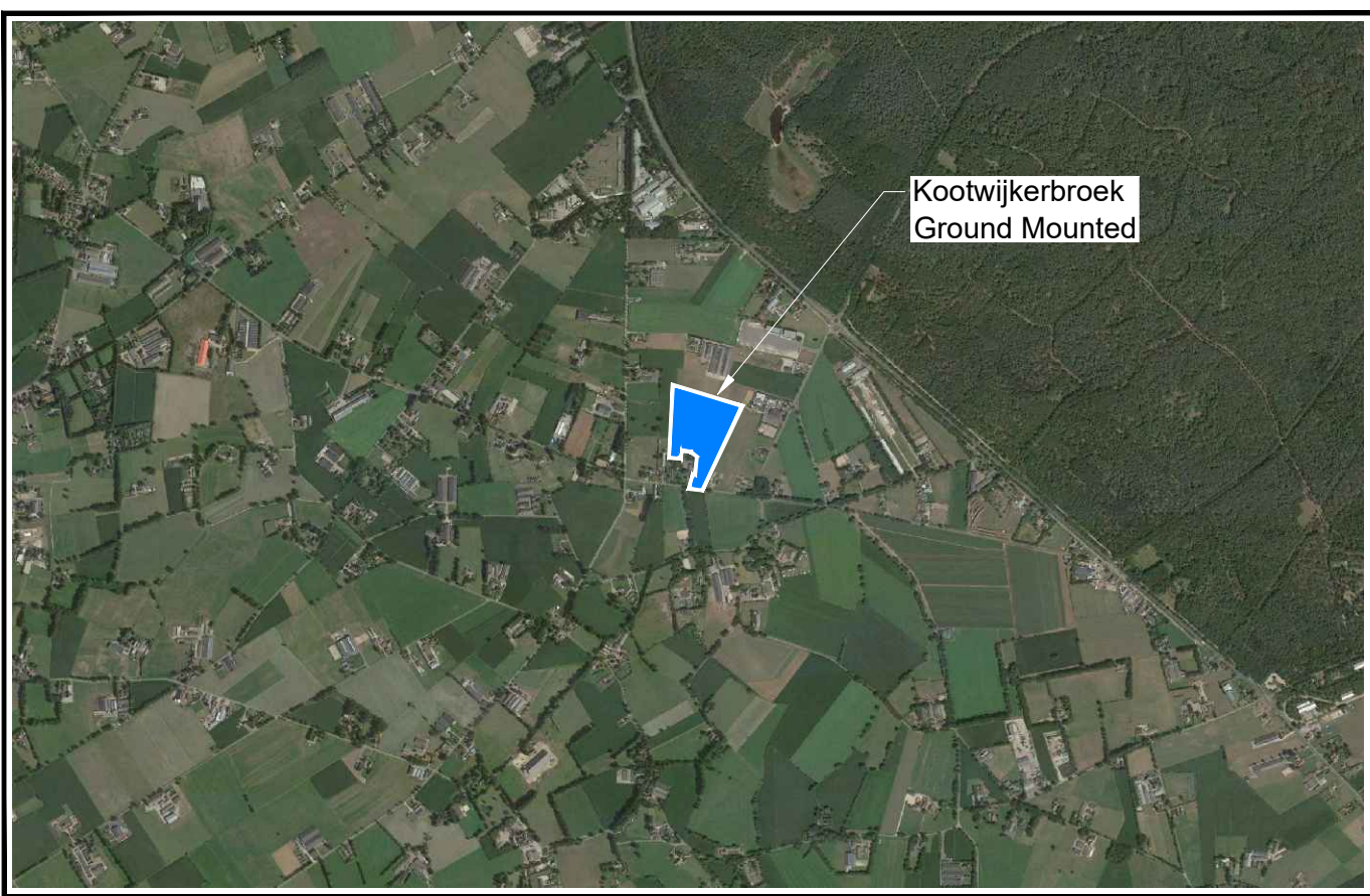
GA - Location No Scale