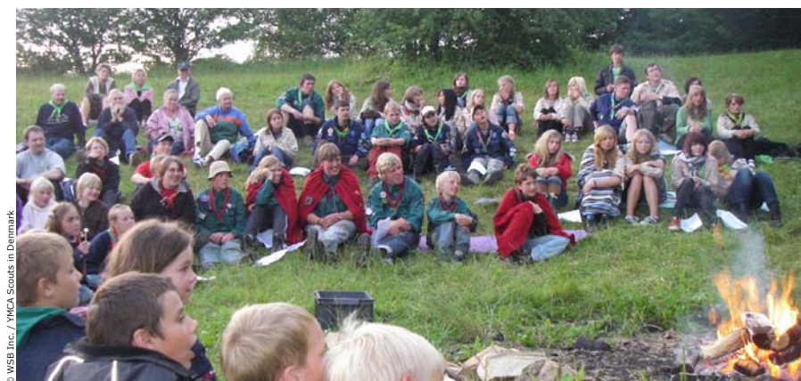
© WSB Inc. / YMCA Scouts in Denmark

Florida Sea Base is located on Islamorada in the heart of the Florida Keys. The educational programme is focused on improving both the marine and the land environment of the area and projects include construction of artificial reefs; removal of invasive, exotic vegetation; cleaning of beaches and erosion control; and replanting trees and other plants destroyed on the islands by recent hurricanes.