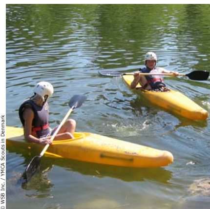
© WSB Inc. / YMCA Scouts in Denmark