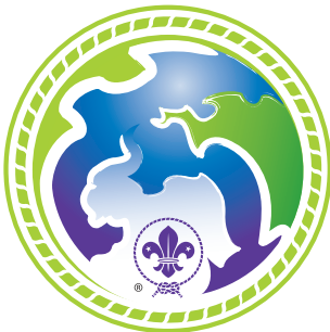
WORLD SCOUT ENVIRONMENT BADGE GREEN IS FOR SCOUTS