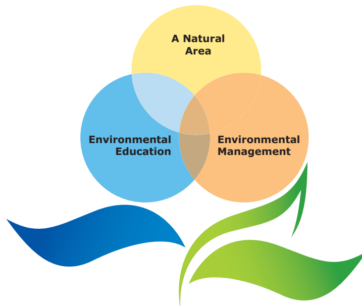
Figure 1: SCENES Diagram

SCENES consists of three key requirements: a natural area, environmental education and environmental management.