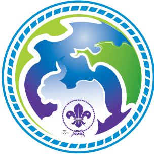
WORLD SCOUT ENVIRONMENT BADGE BLUE IS FOR CUB SCOUTS