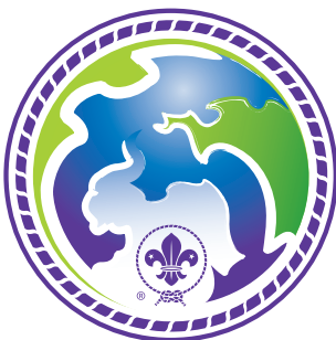
WORLD SCOUT ENVIRONMENT BADGE PURPLE IS FOR ROVER SCOUTS