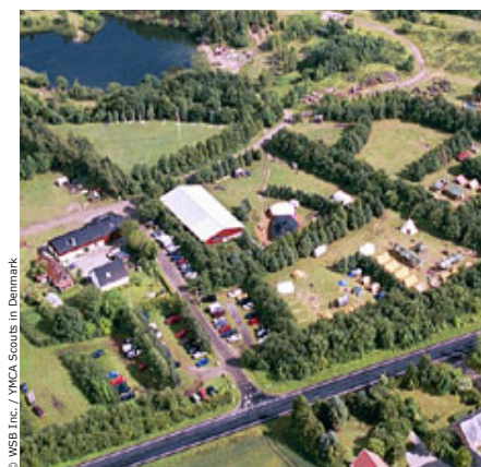
© WSB Inc. / YMCA Scouts in Denmark