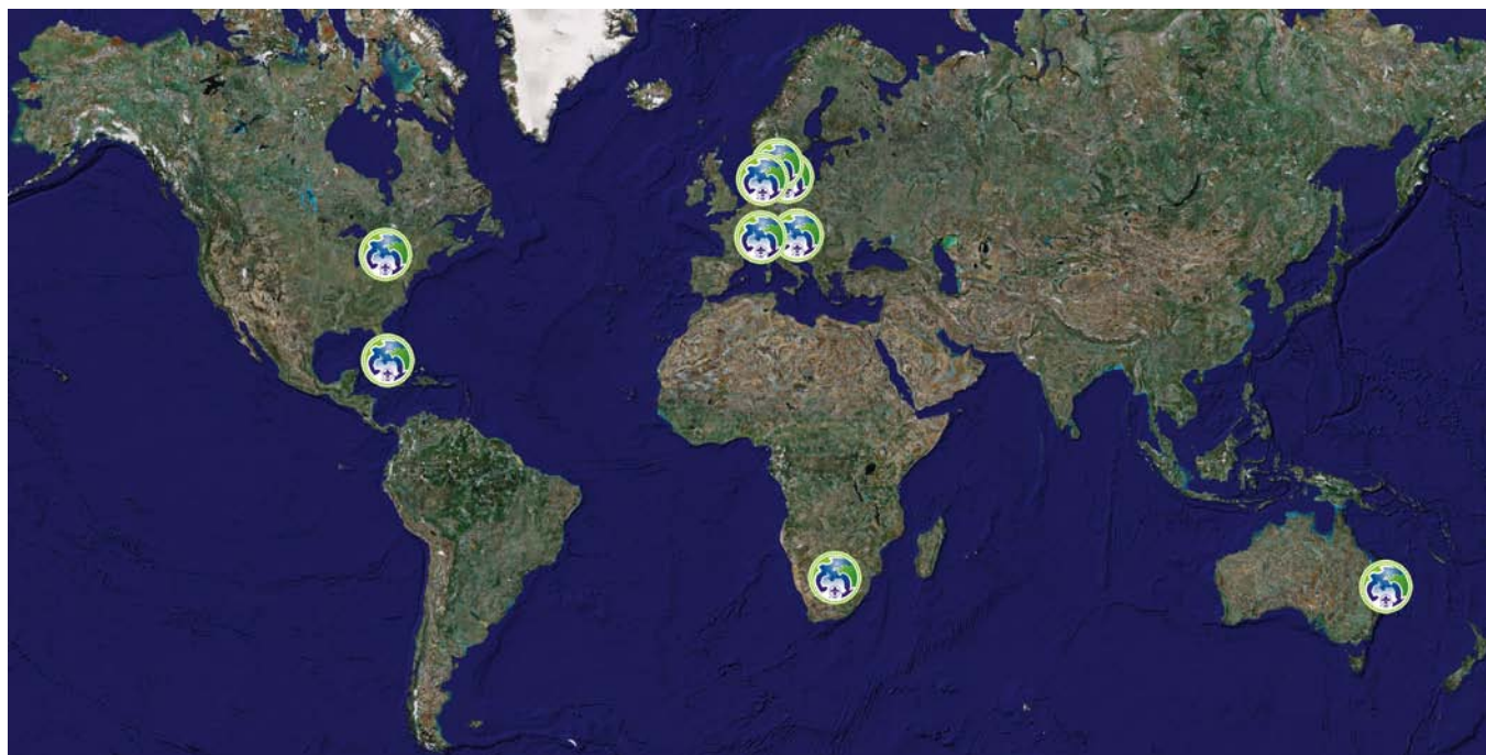
FIGURE 3: SCENES CENTRES AS OF THE 38TH WORLD SCOUT CONFERENCE, 2008.